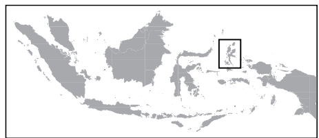
The distribution of Dusky Friarbird Philemon fuscicapillus :

(1) Morotai island; (2) Hilaitetor; (3) Sungai Tolawi; (4) Kali Batu Putih; (5) Buli; (6) Yonelu.