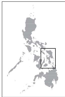
The distribution of Visayan Broadbill Eurylaimus samarensis : (1) Mt Capoto-an; (2) Matuguinao; (3) Bonga; (4) Catbalogan; (5) Paranas; (6) Buluan; (7) Asgad; (8) Jaro; (9) Mt Lobi; (10) Buri; (11) Helosig; (12) Tomas Oppus; (13) Cantaub; (14) Rajah Sikatuna National Park. Historical (pre-1950) Fairly recent (1950–1979) Recent (1980–present)