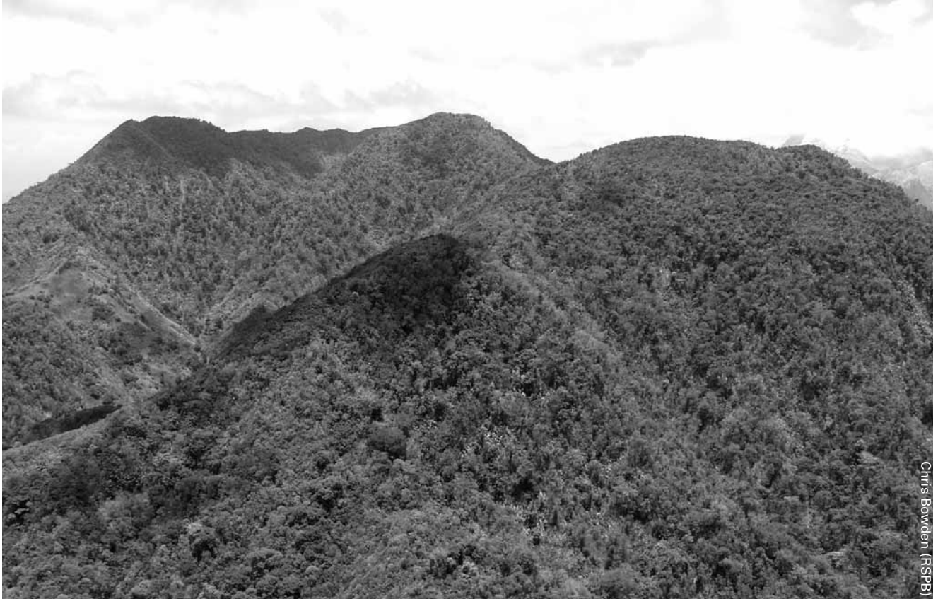
View of the Centre Hills