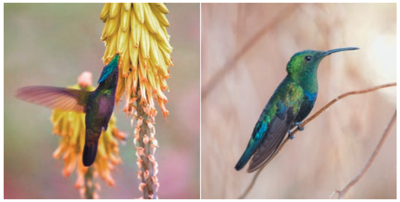
Antillean Crested Hummingbird and Green-throated Carib—two of Statia's restricted-range birds.

the Boven sub-sector, while legally protected is currently the subject of a land dispute and is unmanaged.