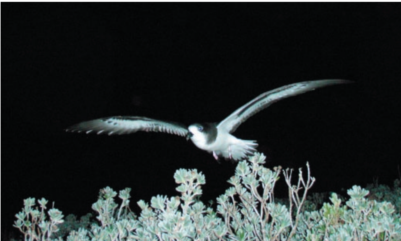
The Bermuda Petrel or Cahow, the islands' national bird.

Bermuda supports just 18 resident (regular) breeding birds, including one endemic sub-species, the Bermuda White-eyed Vireo Vireo griseus bermudianus , and several native species including Mourning Dove Zenaida macroura , Common Ground-dove Columbina passerina , Grey Catbird Dumetella carolinensis , Eastern Bluebird Sialia sialis and Barn Owl Tyto alba . The Yellow-crowned Night-heron Nyctanassa violacea was successfully reintroduced to Bermuda for natural control of the abundant red land crab Gecarcinus lateralis , after the discovery of sub-fossil remains in limestone caves and the descriptions of early settlers confirmed that the bird once nested there. Breeding of the Green Heron Butorides virescens , suspected for years, was confirmed in 2003 around the edge of the mangrove-fringed Trott's Pond and Mangrove Lake; it extended its breeding range in 2004 and by 2008 was nesting in at least seven locations around Bermuda. Three seabird species visit Bermuda to breed: the Cahow P. cahow (as discussed above); White-tailed Tropicbird Phaethon lepturus , with c.2,000 nesting pairs found on coastal cliffs and offshore islands around Bermuda; and Common Tern Sterna hirundo nests on small rocks and islets in several of the larger inshore harbours, maintaining a small population of 18–25 nesting