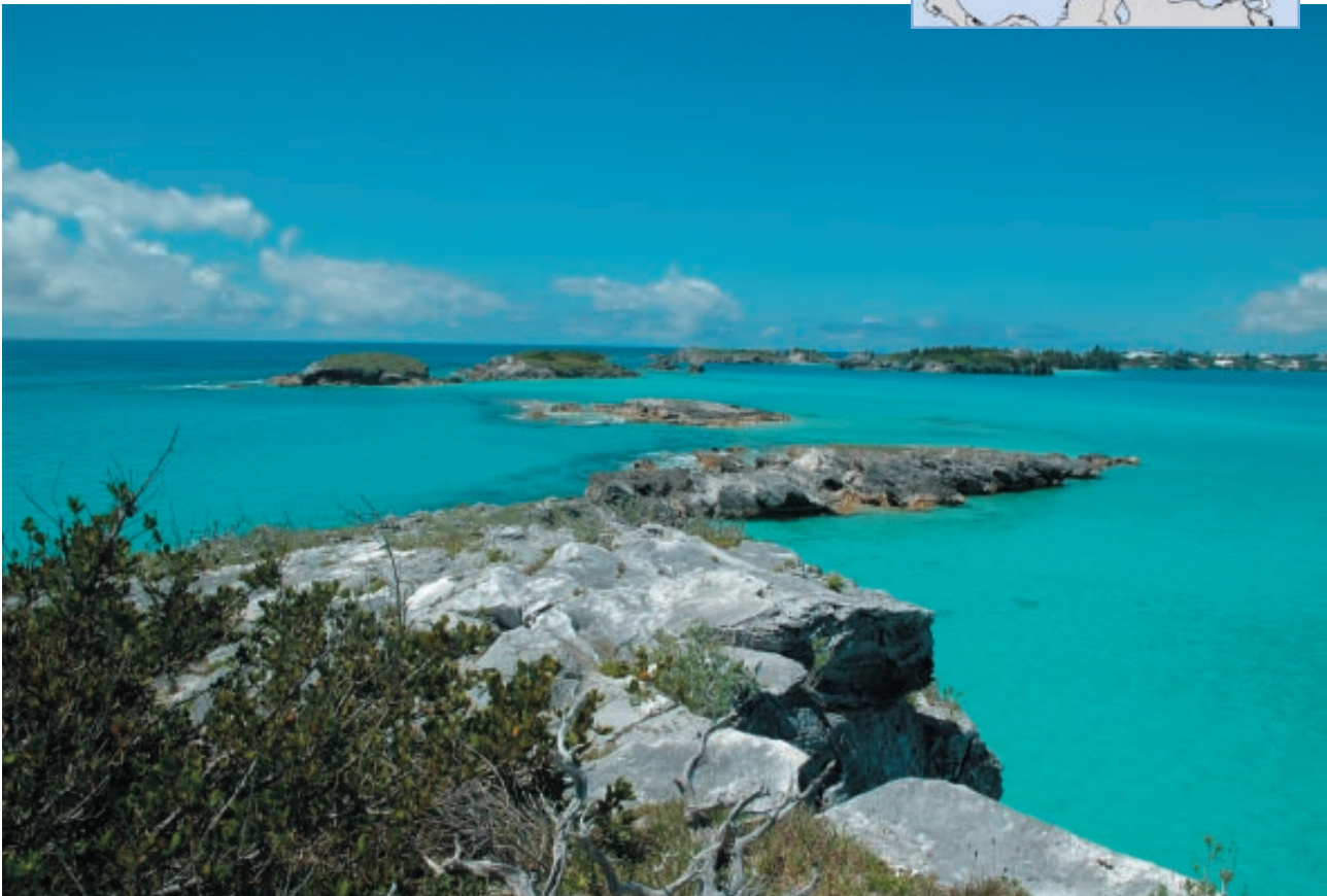
Castle Harbour Islands, at the eastern end of Bermuda.