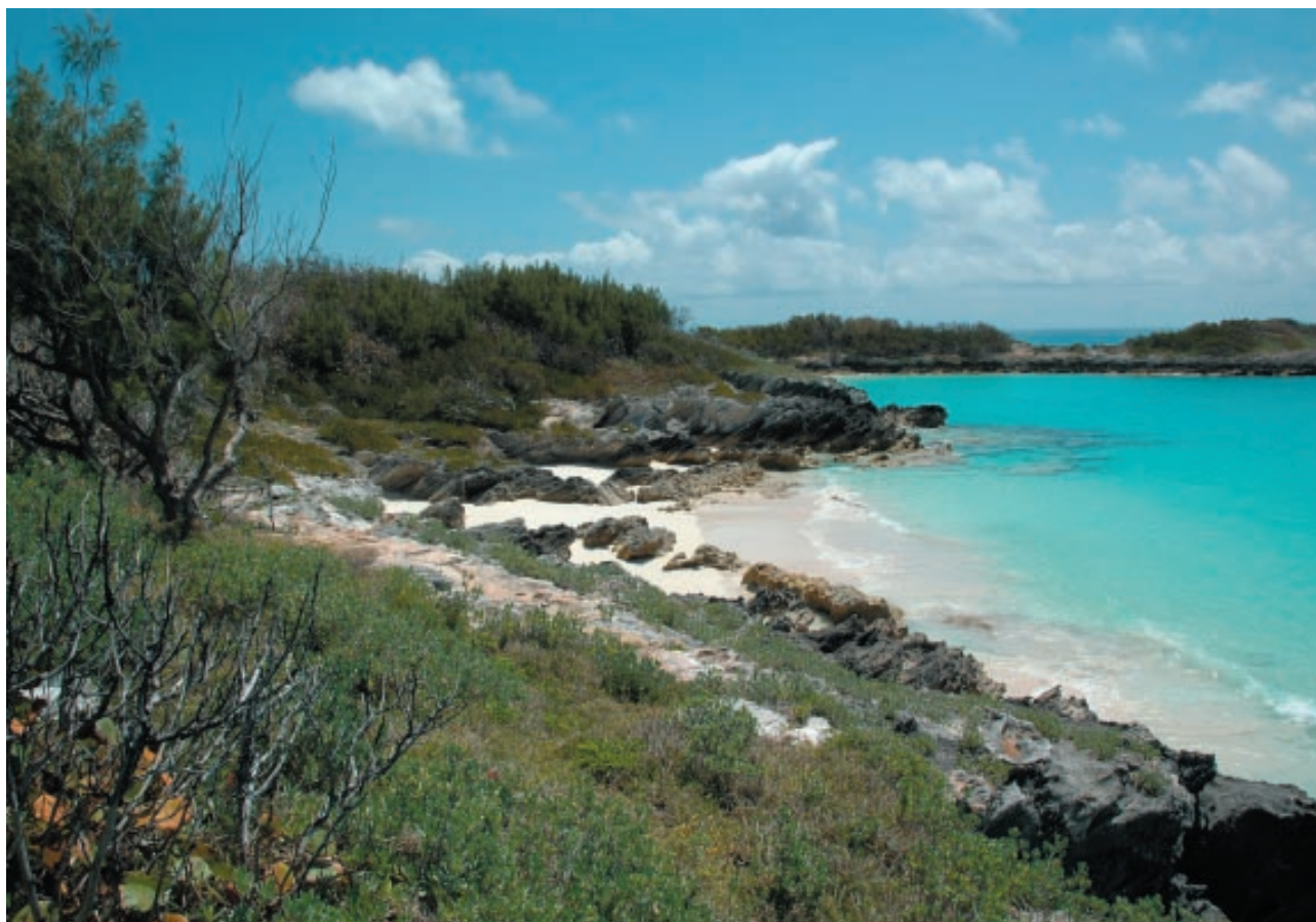
The coast of Nonsuch Island Living Museum, the focus of a restoration project since 1960.

Bermuda's small size and geographical isolation have made it very difficult for mammals, amphibians and reptiles to become naturally established. Prior to human settlement, only one species of terrestrial reptile was resident, the endemic rock lizard or Bermuda skink Eumeces longirostris , which is now only common on some of the offshore islands, in particular the Castle Harbour Islands. Because of accidental and deliberate introduction by man, there are two species of rat— Rattus norvegicus and Rattus rattus —now common on Bermuda, as well as the house mouse Mus musculus . There is also a large population of domestic and feral house cats, which impact on bird populations in some areas. Dogs are much better controlled, with a dog authority enforcing annual licensing and compulsory microchip tagging, ensuring that there are very few, if any, feral animals. Other mammals sold primarily as pets, such as guinea pigs and hamsters, are occasionally released in parks or nature reserves by irresponsible owners. Attempts by pet stores to introduce other exotic mammals, such as African pygmy hedgehogs and descended skunks, were recently prevented by the introduction of new legislation.