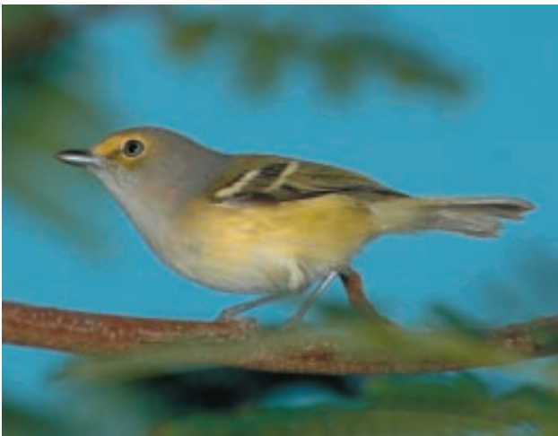
Bermuda's endemic subspecies of White-eyed Vireo.