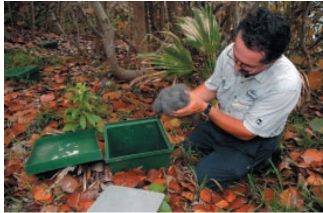
Cahow chick being translocated to an artificial nest burrow on Nonsuch Island.

Bermuda supports just 18 resident (regular) breeding birds, including one endemic sub-species, the Bermuda White-eyed Vireo Vireo griseus bermudianus , and several native species including Mourning Dove Zenaida macroura , Common Ground-dove Columbina passerina , Grey Catbird Dumetella carolinensis , Eastern Bluebird Sialia sialis and Barn Owl Tyto alba . The Yellow-crowned Night-heron Nyctanassa violacea was successfully reintroduced to Bermuda for natural control of the abundant red land crab Gecarcinus lateralis , after the discovery of sub-fossil remains in limestone caves and the descriptions of early settlers confirmed that the bird once nested there. Breeding of the Green Heron Butorides virescens , suspected for years, was confirmed in 2003 around the edge of the mangrove-fringed Trott's Pond and Mangrove Lake; it extended its breeding range in 2004 and by 2008 was nesting in at least seven locations around Bermuda. Three seabird species visit Bermuda to breed: the Cahow P. cahow (as discussed above); White-tailed Tropicbird Phaethon lepturus , with c.2,000 nesting pairs found on coastal cliffs and offshore islands around Bermuda; and Common Tern Sterna hirundo nests on small rocks and islets in several of the larger inshore harbours, maintaining a small population of 18–25 nesting