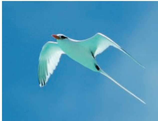
White-tailed Tropicbird, Bermuda's commonest seabird.

pairs. Hurricane Fabian (2003) had a disastrous effect on S. hirundo , with only six pairs returning to breed in 2004, and 9–10 pairs breeding in 2008.