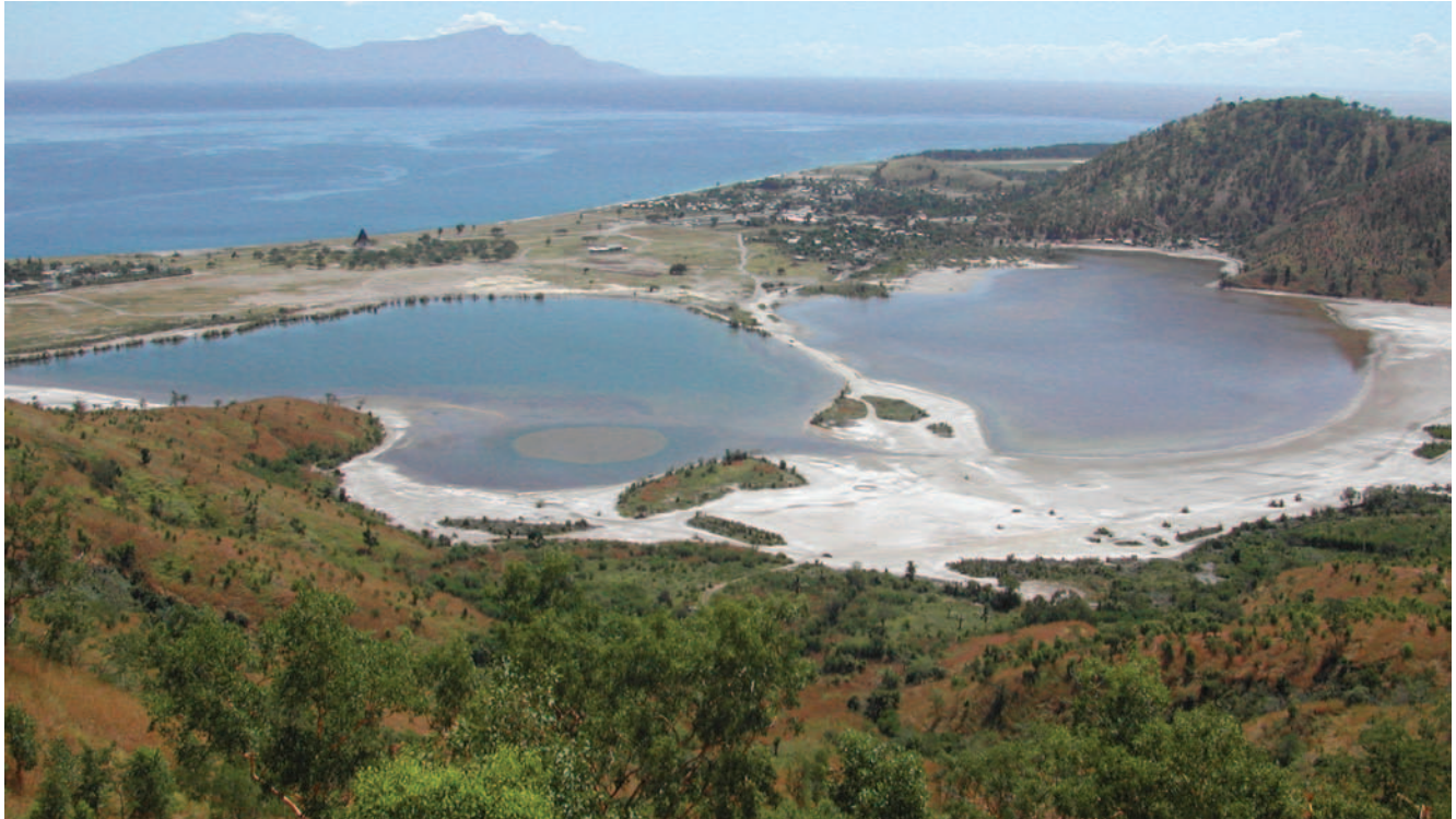
Saline lakes and savanna in Tasitolu Peace Park (IBA 13), which supports several restricted-range species of the Timor and Wetar Endemic Bird Area.

LAND AREA 14,609 km 2 HUMAN POPULATION 884,000 (61 per km 2 ) NUMBER OF IBAs 16 TOTAL AREA OF IBAs 1,852 km 2 STATUS OF IBAs 11 protected; 5 unprotected