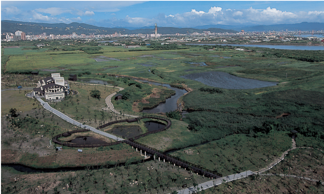
The Nature Center at Kuantu (IBA 3) in Taipei.

TAIWAN LAND AREA 36,188 km 2 HUMAN POPULATION 22,092,000 (610 per km 2 ) NUMBER OF IBAs 53 TOTAL AREA OF IBAs 6,806 km 2 STATUS OF IBAs 11 protected; 17 partially protected; 25 unprotected