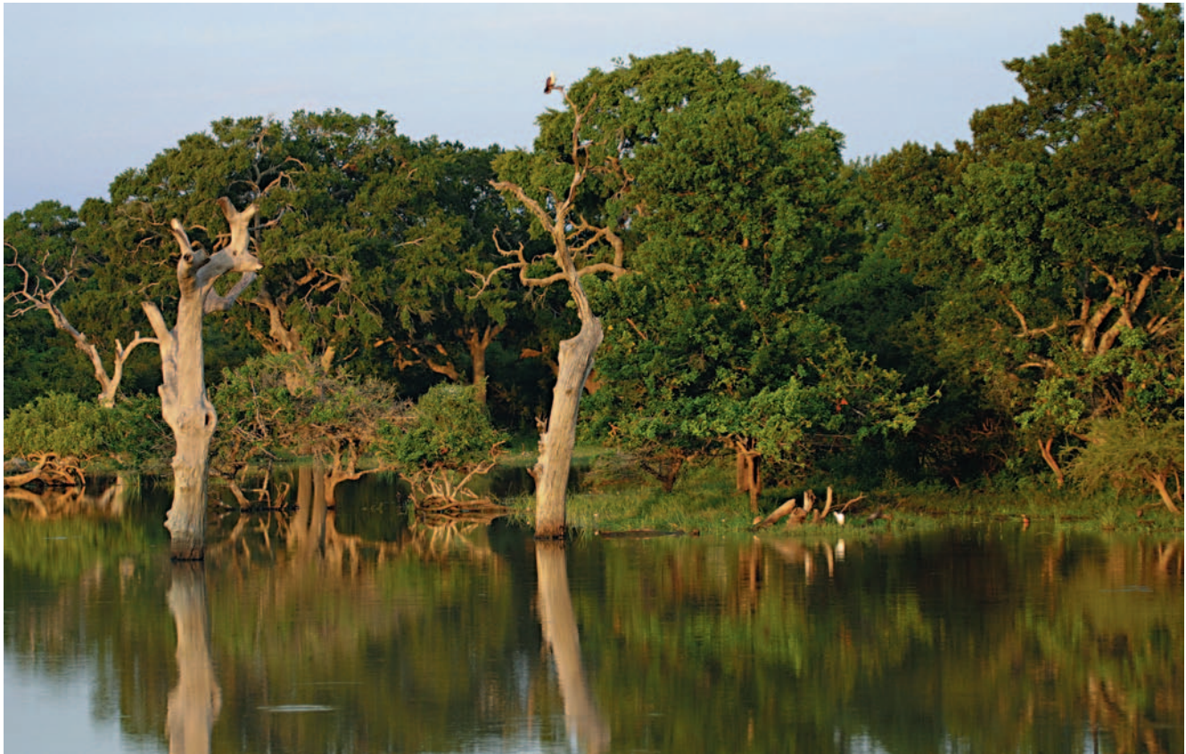
Table 1. Important Bird Areas in Sri Lanka.

Yala (IBA 170) supports large numbers of congregatory waterbirds, including the threatened Spot-billed Pelican Pelecanus philippensis and Lesser Adjutant Leptoptilos javanicus .