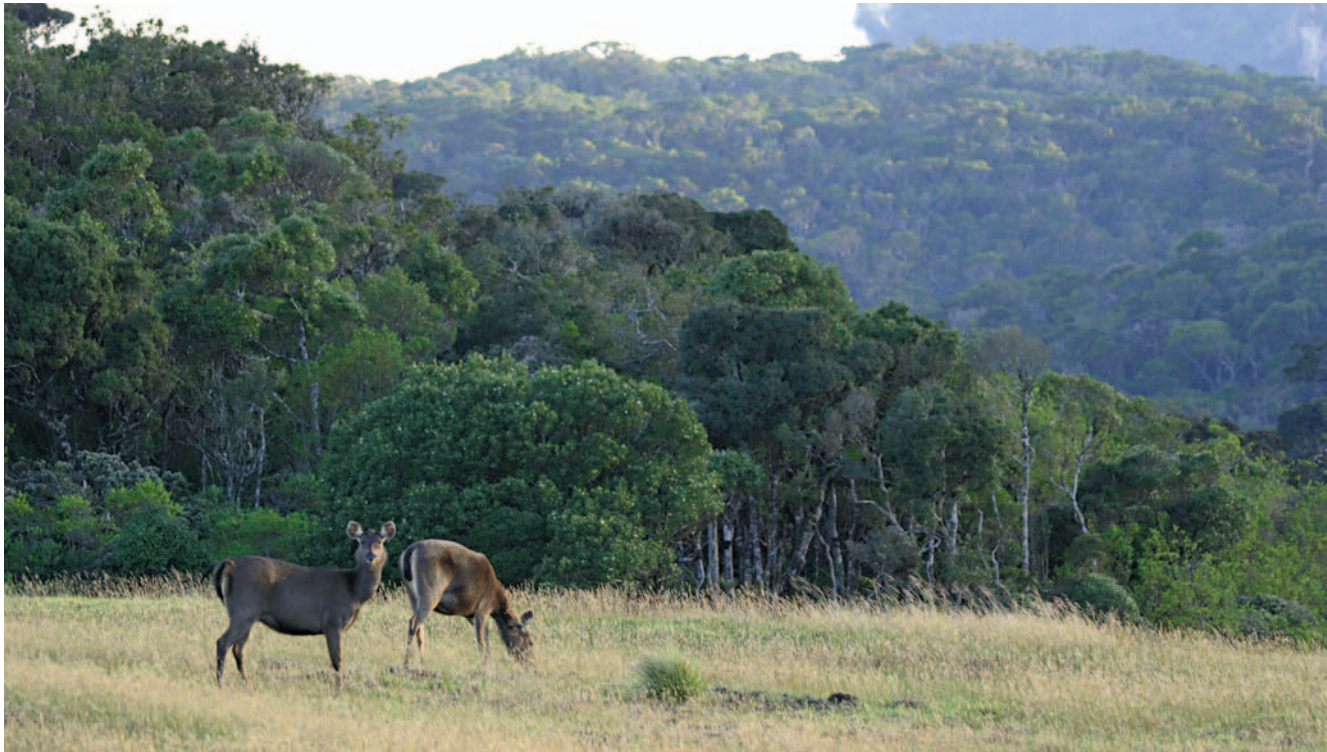
The relatively undisturbed and extensive montane forests in Horton Plains (IBA 33) are extremely rich in biodiversity, including many species endemic to Sri Lanka.

LAND AREA 65,610 km 2 HUMAN POPULATION 18,820,000 (287 per km 2 ) NUMBER OF IBAs 70 TOTAL AREA OF IBAs 3,933 km 2 STATUS OF IBAs 18 protected; 52 unprotected