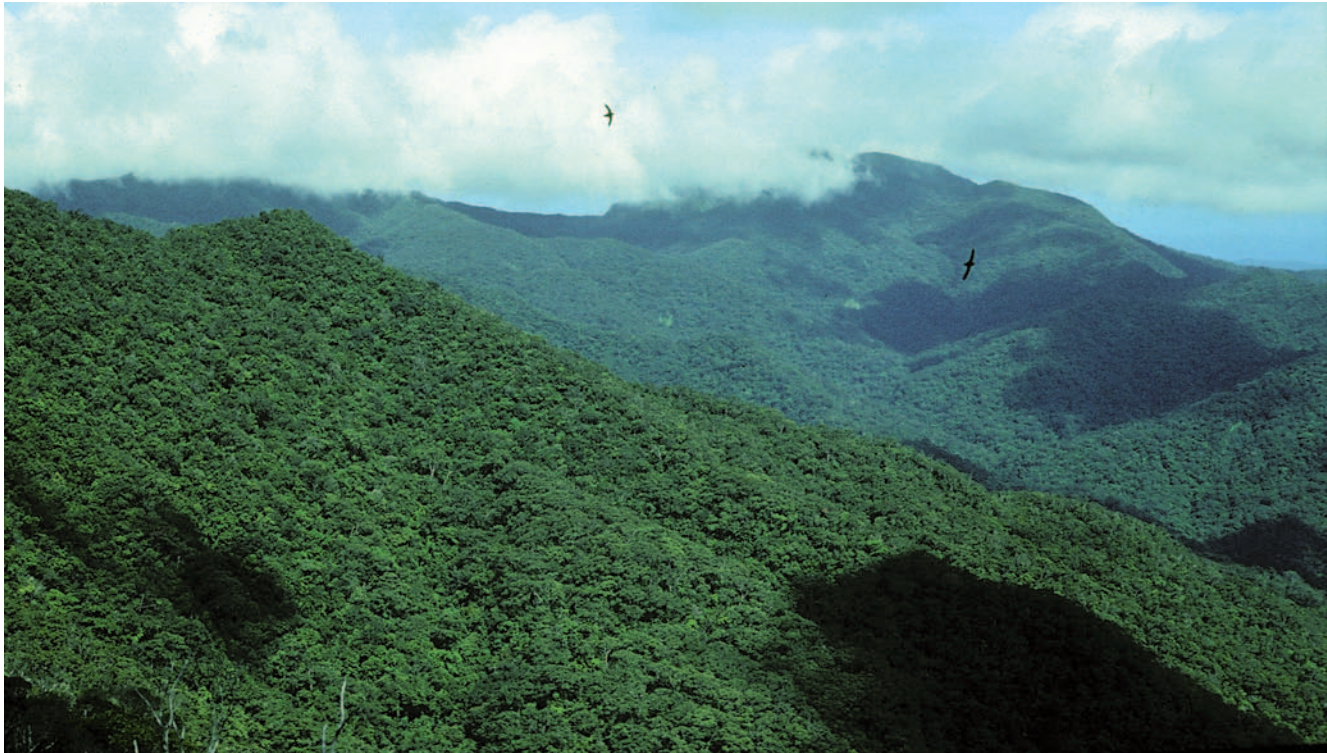
Much of the original forest in the Philippines has been cleared, but in Northern Sierra Madre Natural Park (IBA 15) undisturbed forest still extends from the coast to the mountain peaks.

NUMBER OF IBAs 117 TOTAL AREA OF IBAs 32,302 km 2 STATUS OF IBAs 47 protected; 23 partially protected; 47 unprotected