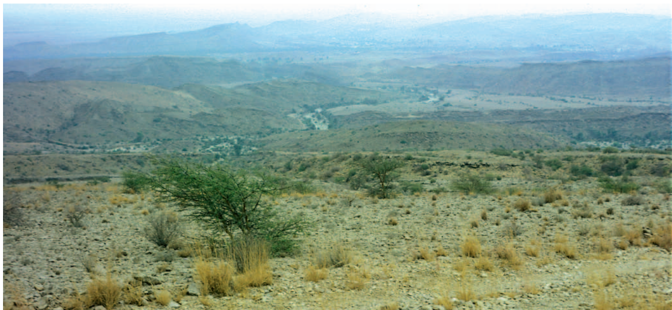
Arid scrubland and desert in Kirthar National Park (IBA 46).