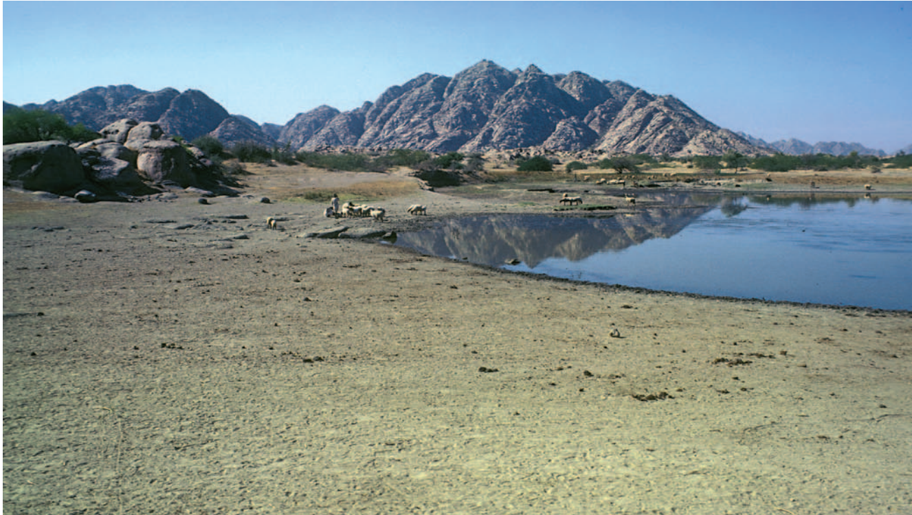
The vast Rann of Kutch Wildlife Sanctuary (IBA 55) protects a variety of desert and wetland habitats.

NUMBER OF IBAs 55 TOTAL AREA OF IBAs 46,701 km 2 STATUS OF IBAs 33 protected; 9 partially protected; 13 unprotected