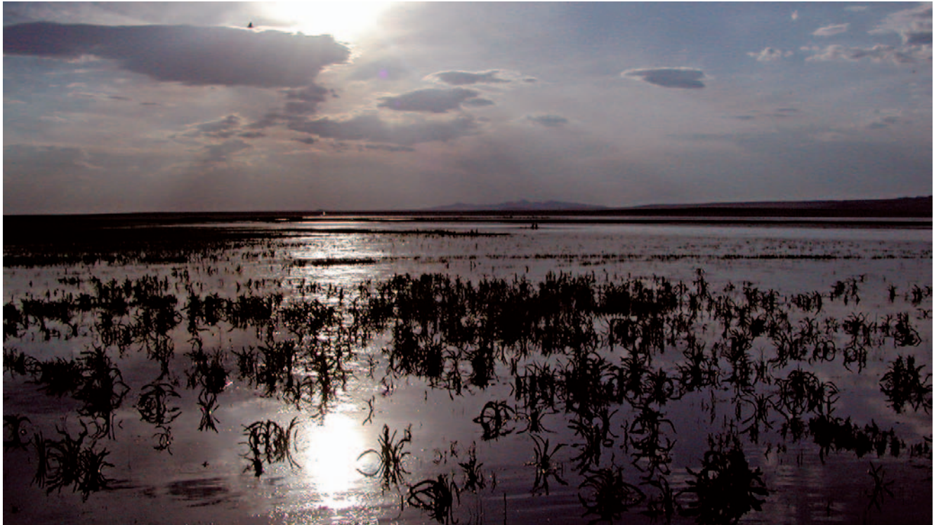
The only active breeding colony of Dalmatian Pelican Pelecanus crispus in eastern Asia is at Airag Nuur (IBA 7).

NUMBER OF IBAs 41 TOTAL AREA OF IBAs 16,584 km 2 STATUS OF IBAs 12 protected; 4 partially protected; 25 unprotected