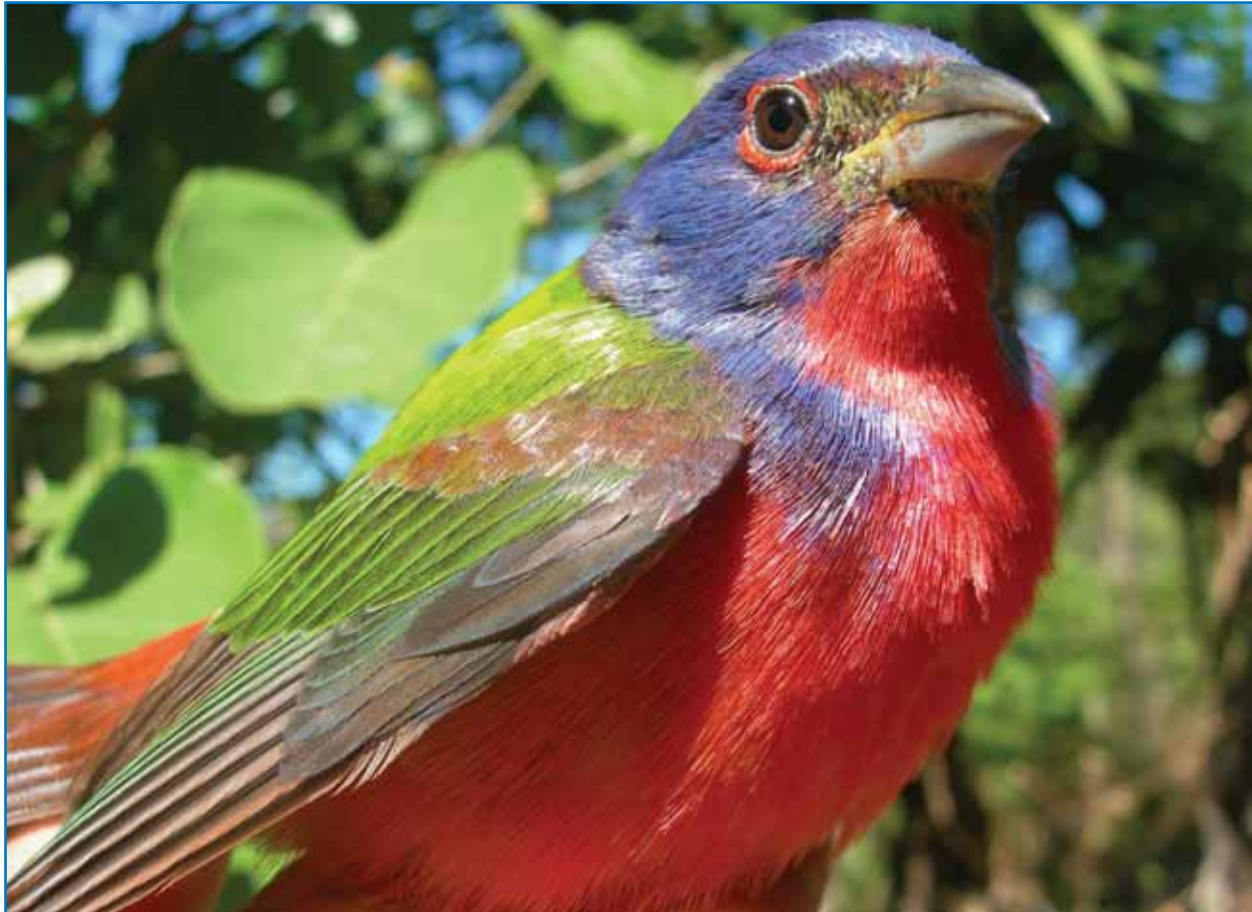
The Near Threatened Painted Bunting ( Passerina ciris ) is found at all of El Salvador's IBAs. This declining migratory bird is a non-breeding visitor from the southern United States.