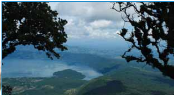
Lake Coatepeque caldera (crater lake) from Cerro Verde, overseeing part of the Complejos Los Volcanes y San Marcelino IBA (SV004). The National Park in this IBA has been managed by SalvaNATURA since 2003.

Ornithological activity has steadily increased in El Salvador since the end of a 12-year civil conflict in 1991. In 1997, a working group for bird conservation was formed, as a national chapter of the Partners-in-Flight hemispheric network of bird conservation organizations. This group operates an electronic list-serve and since 2006 has met monthly to discuss bird conservation issues. The principal participants are university students, government technicians working at MARN's natural heritage office, and staff of the SalvaNATURA Conservation Science Program. The group began the publication of a newsletter called Aratinga in 2008.