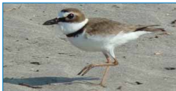
Barra de Santiago (SV001) and Jiquilisco y Jaltepeque (SV014) IBAs each attract hundreds of Wilson's Plover ( Charadrius wilsonia ), and are listed as important wintering sites in this species' Conservation Plan. The latter site is also an important breeding area with more than 60 pairs.

El Salvador has two biosphere reserves registered with UNESCO. The Apaneca-Ilamatepec Biosphere Reserve, located in the Conservation Area of the same name, includes Los Volcanes National Park and several smaller protected areas. Part of the conservation objectives of this reserve are social: preserving and recuperating traditional (biodiversity-friendly) practices of coffee cultivation and the last indigenous villages in the country. The Xirihualtique-Jiquilisco Biosphere Reserve, located in the Bahía de Jiquilisco Conservation Area, was created to recover traditional ecological knowledge related to the use and management of coastal resources at one of the most important mangrove ecosystems in Central America (Zulma de Mendoza, pers. comm.).