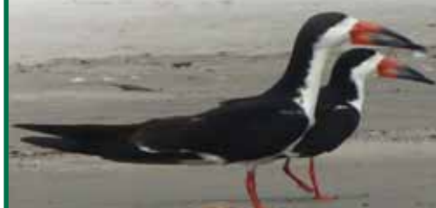
The southernmost nesting colony of the North American race of Black Skimmer ( Rynchops niger niger ) is located at the Jiquilisco-Jaltepeque IBA (SV014) in El Salvador.

Next steps for the IBA program in El Salvador include popularizing the concept, through Spanish-language publications, IBA designation celebrations at the site level, official recognition by the El Salvador government, and installation of signage where roads intersect IBA boundaries. A priority will be to provide training and technical assistance to conservation activists working inside each of the IBAs. Another urgent challenge, of considerably higher difficulty, is to expand the current protected area coverage within each IBA.