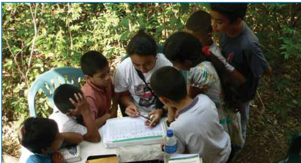
Bird monitoring with mist nets has proven to be a useful environmental education tool for children at Bosque El Imposible IBA (SV002).

The development of the IBA program in El Salvador led to the creation of the Communities and Biodiversity Training Program, as a strategy for increasing on-the-ground conservation action within the nearly 100 IBAs of northern Central America. Several hundred small communities are located within the IBAs, and the only way to assure protection of so many sites is to motivate the local people to take action. SalvaNATURA, the BirdLife affiliate in El Salvador, with financial assistance from the Citi Foundation, Humane Society International, the Critical Ecosystems Partnership Fund and other donors, will offer a short course to 100 community leaders during 2009, from Hon-