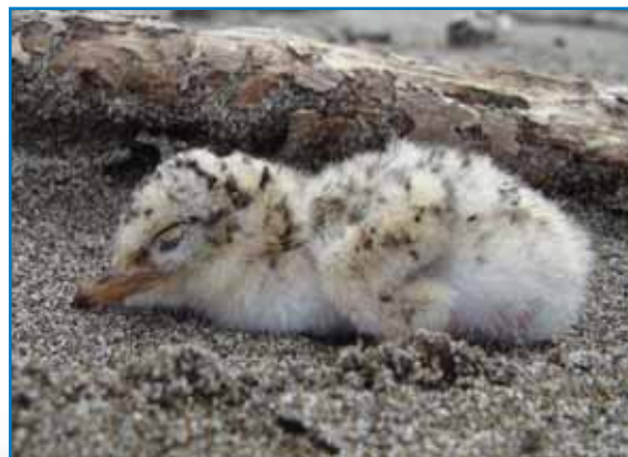
A 2-day old Least Tern ( Sterna antillarum) at the Jiquilisco-Jaltepeque IBA (SV014), home of the only documented colony for the species on the Pacific shore of Central America. In 2008, high tides wiped out the colony.

One of El Salvador's two world heritage sites is the Xirihualtique-Jiquilisco Biosphere Reserve, a large coastal bay and estuary site. As the first coastal IBA identified in El Salvador, this site garnered the attention of SalvaNATURA and National Audubon Society (BirdLife partner in the US), who worked together to obtain $30,000 in grant funds for shorebird conservation at the site during 2008 and 2009. The determination of IBA status was key in winning these funds. The first year of field work included environmental education for more than 300 school children, bird identification training for 12 tour guides, and the removal of 32 tons of trash washed up on 20 km of beaches and mudflats. The project also included weekly monitoring of shorebirds, and nest counts of seven breeding species, including American Oystercatcher ( Haematopus palliatus ), Wilson's Plover ( Charadrius wilsonia ), Black-necked Stilts ( Himantopus mexicanus ), and beach-nesting Lesser Nighthawks ( Chordeiles acutipennis ). In 2008, project researchers documented El Salvador's first successful nesting of Collared Plovers ( Charadrius collaris ), but complete failure at the continent's southernmost colonies of Least Tern ( Sterna antillarum ) and Black Skimmer ( Rynchops niger ).