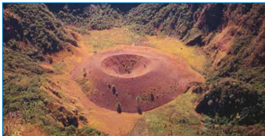
Just a few kilometers from El Salvador's capital is Volcán de San Salvador IBA (SV007). The Boquerón has interesting highland birds and also an impressive, 500-m deep crater.

Today, over 90% of El Salvador's population is of mixed European and indigenous ancestry (mestizo). About 9% is of European ancestry (white) and about 1% are Amerindian (CIA 2009), although some sources indicate that nearly 5% are indigenous. Almost one third of the population lives in greater metropolitan San Salvador, the capital. El Salvador has no official religion although Roman Catholicism and Protestantism account for 57% and 21% of the population respectively (5% other religions and 17% non-religious, CIA 2009).