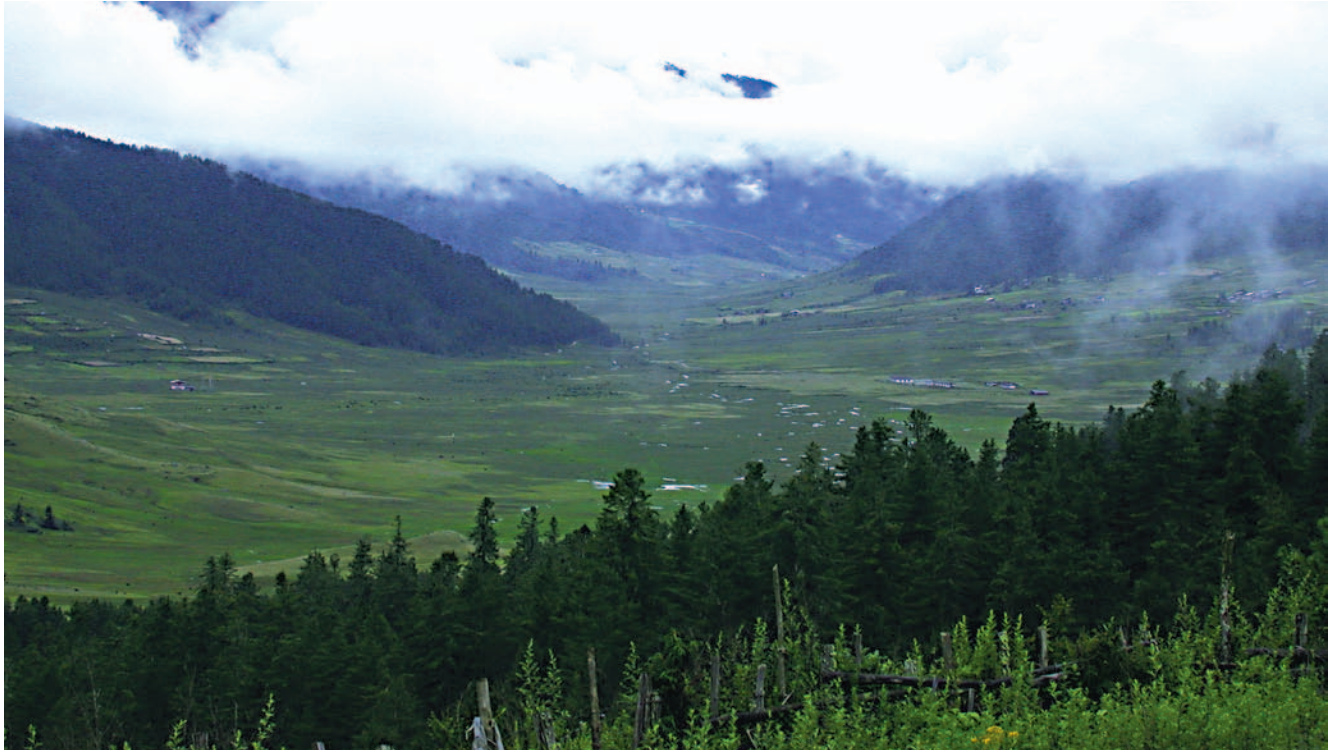
Phopjika and Khatekha valleys (IBA 9) support the only major wintering populations of Black-necked Crane Grus nigricollis outside China.

NUMBER OF IBAs 23 TOTAL AREA OF IBAs 12,133 km 2 STATUS OF IBAs 8 protected; 15 unprotected